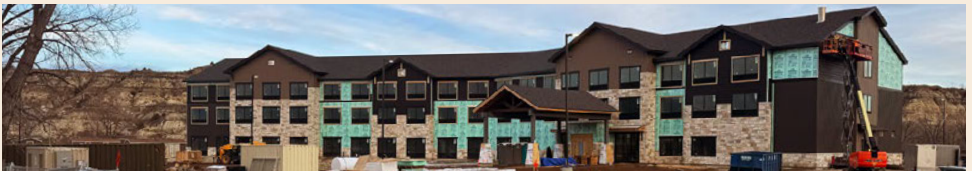
Hotel 1883; photo taken January 2026

Another TRMF construction project, The Ranch at Bully Pulpit, has also undergone a massive change in the last few months. After the groundbreaking in November, several buildings have already been constructed.