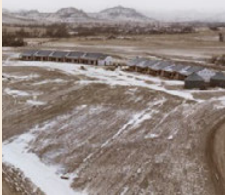
Above photo: The Ranch at Bully Pulpit; photo taken January 2026