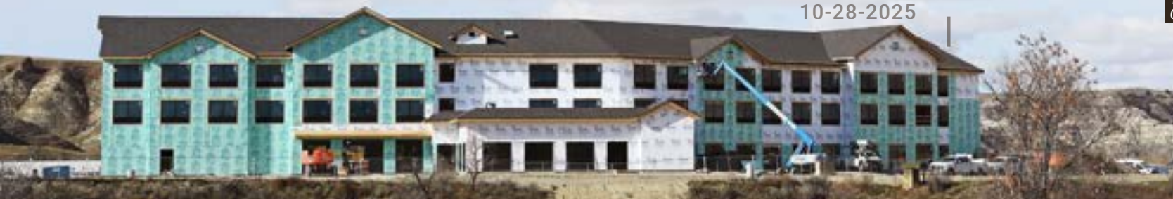
THE PRESIDENTIAL LODGE 10-28-2025