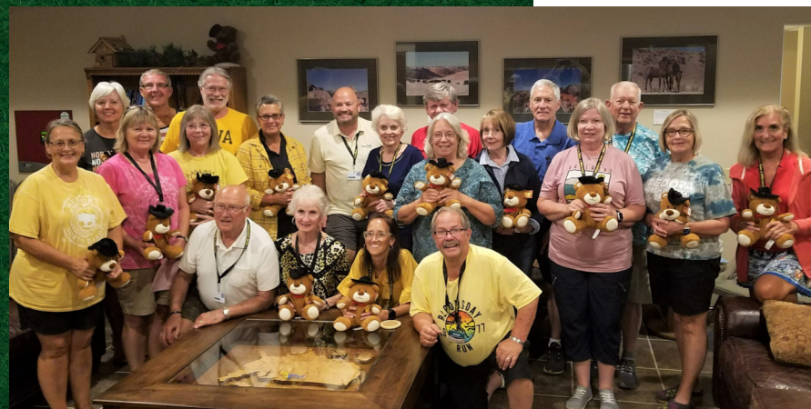
Above: A group of in-season volunteers during the summer of 2022.