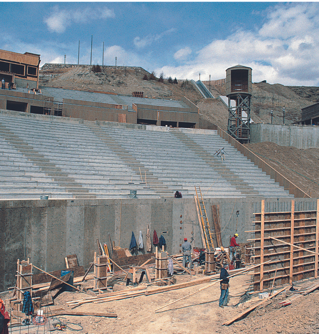
Above: Reconstruction of the Burning Hills Amphitheatre underway between 1991 and 1992.