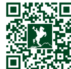
Scan this code to see our video celebration of the 2022 TRMF Volunteers!