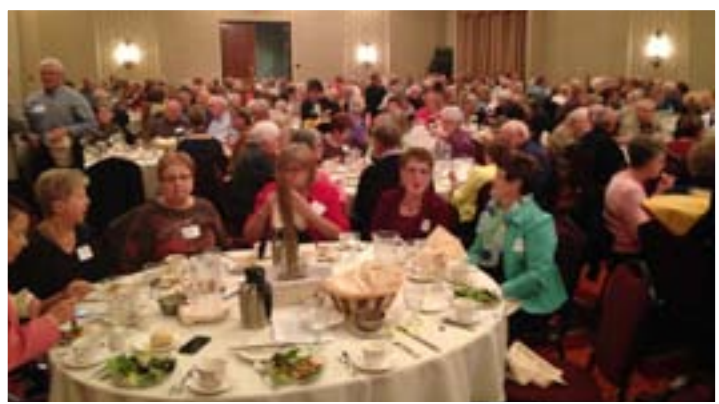
them to visit in 2016. Medora Volunteers are our best ambassadors. Thank you, Volunteers!

Hundreds of our summer volunteers spent an afternoon with us this fall, at our Volunteer Appreciation Luncheons in Fargo (at right) and Medora. It's our chance to say "Thank You" for the invaluable help we get from our volunteers each summer. Our Volunteer List now includes more than 1,400 people from across the country and Canada. And now, those volunteers are challenging themselves to do even more. In 2016, each of our volunteers is being challenged to bring ten new people to Medora. Our volunteers will talk to their circle of friends and relatives who don't know about Medora, or who haven't ever visited, and encourage