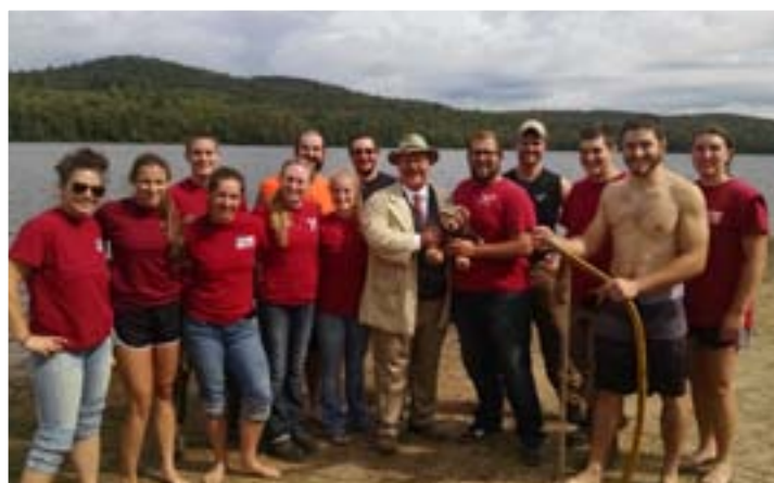
TR presents a Medora National Parks Centennial Teddy Bear to the State University of New York ESF Lumber Jacks and Lumber Jills, winners of the Teddy Roosevelt Days competition in Newcomb, New York.