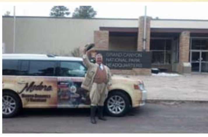
TR at the gate of Grand Canyon National Park. Grand Canyon was one of the first areas protected by Theodore Roosevelt under the Antiquities Act.