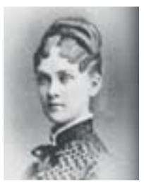
Alice Lee Roosevelt in 1883

It’s the first time anyone has published all of Roosevelt’s early diaries. The task is not simple—the diaries are not all in one place. Some are in the Library of Congress Collection in Washington, D.C., some at the Houghton Library at Harvard, both repositories of tens of thousands of Roosevelt documents and artifacts. The Theodore Roosevelt Center at Dickinson State University is in the process of digitizing all of the Roosevelt documents from both collections. The diaries will be part of that process at some point—all in one place, online. In fact, the work already done over the past few years