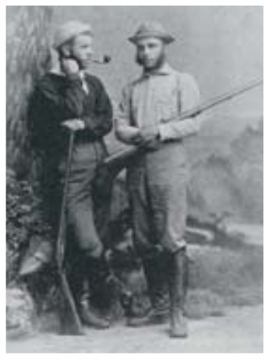
Young Theodore Roosevelt (right) and his brother Elliot on their first hunting trip to Dakota Territory.

his wife just a few years later. He wrote in his diary of June 30, 1878, just four months after his father’s death “Nothing but my faith in the Lord Jesus Christ could have carried me through this, my terrible time.” Who knew that young Theodore taught Sunday School during much of his time at Harvard? And who knew, also, how wealthy Roosevelt was at an early age—his inheritance from his father when young TR was just 19 was an allowance of $8,000 a year. Those 1878 dollars might translate to around $200,000 in today’s dollars, a princely sum for a college student. The book, via the diaries, turns quickly to joy during Roosevelt’s junior year at Harvard when he first seems to have discovered girls, and, specifically, Alice Hathaway Lee, to whom he was married on his 22nd birthday in 1880. When he has fallen in love with Alice and she has agreed