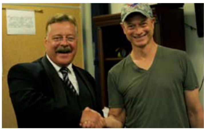
TR meets with Gary Sinise, star of the movie Forest Gump and other Hollywood productions, at Minot Air Force Base.