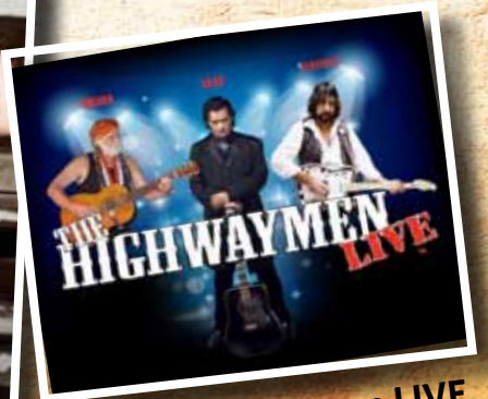
The Highwaymen LIVE Monday, August 21