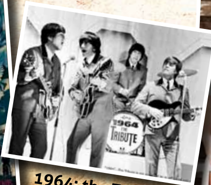
1964: the Tribute Monday, July 10