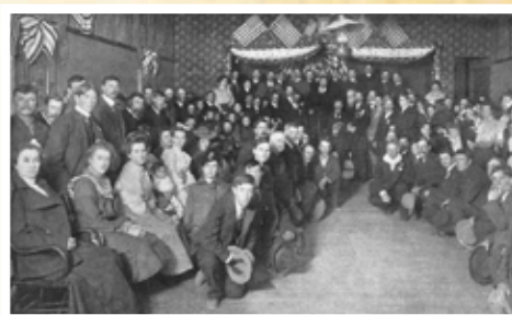
President Theodore Roosevelt (center) and his Medora friends in 1903 in the Medora Town Hall, now the Old Town Hall Theater.