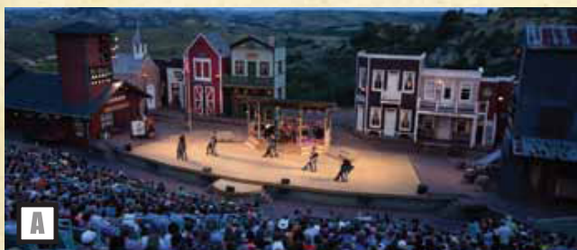
Medora Musical : Two non transferable season passes