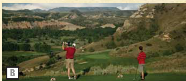
Bully Pulpit : Two Rounds of Golf