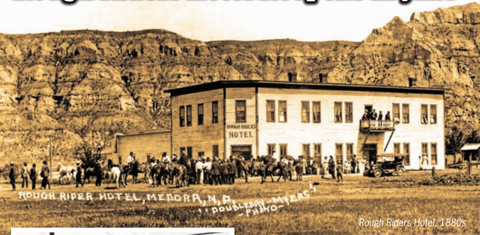
Rough Riders Hotel, 1880s