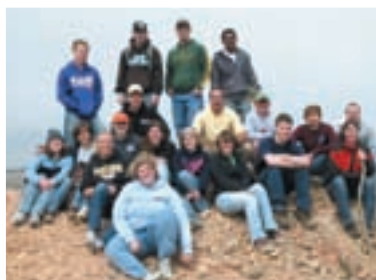
2008 Campus Crusade Badlands Summer Project workers gather atop a Badlands butte.

The Medora Foundation employs individuals from a wide range of backgrounds in Medora each year, and the majority of our seasonal employees are college students who choose to spend their summer vacation working in Medora. However, many of our visitors and sponsors aren't aware that, of those college students,