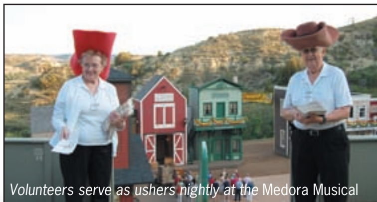
Volunteers serve as ushers nightly at the Medora Musical