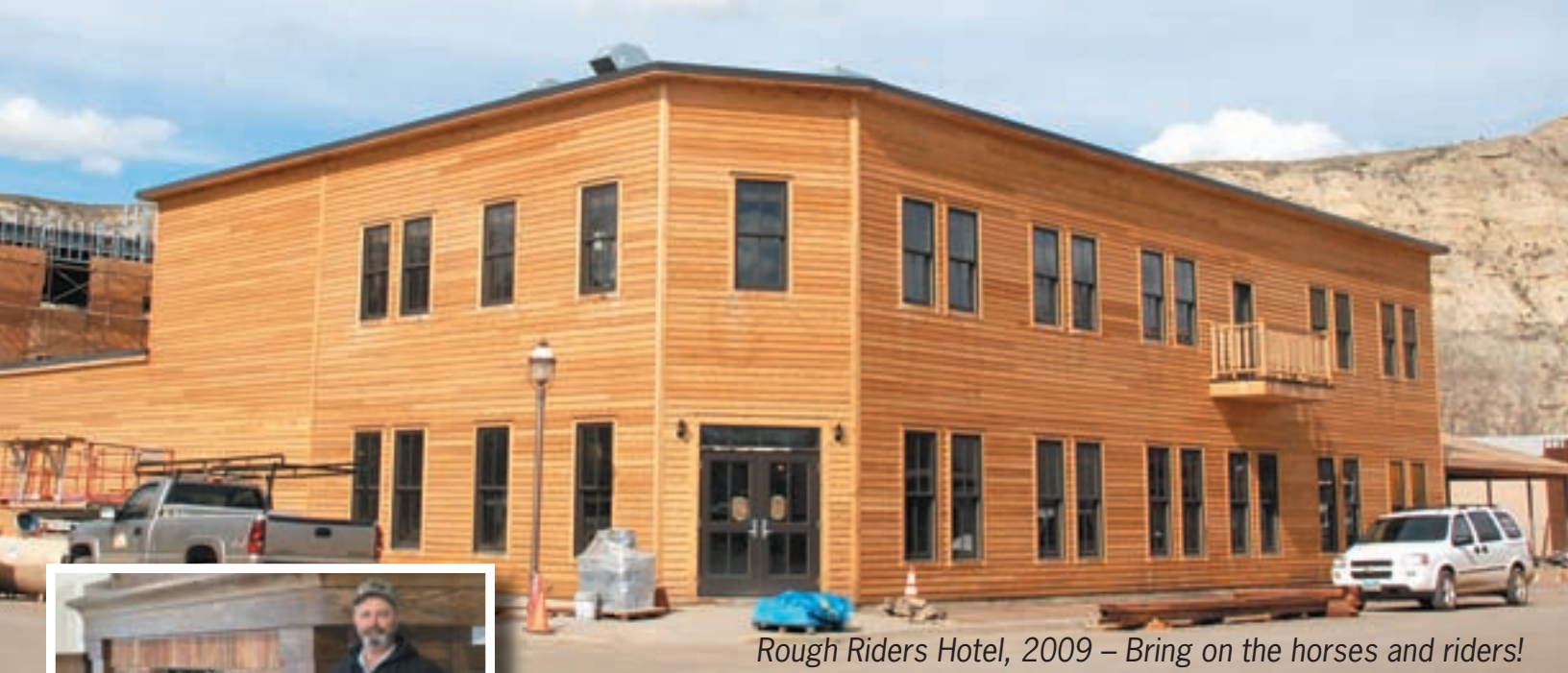
Rough Riders Hotel, 2009 – Bring on the horses and riders!