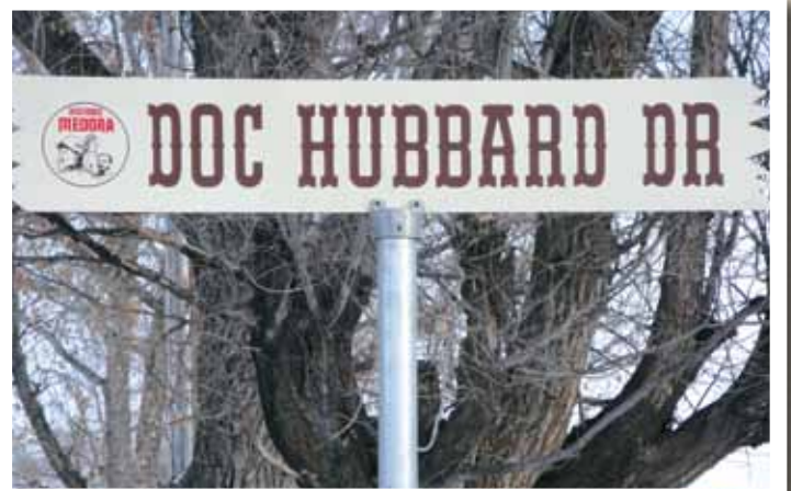
Doc Hubbard Drive is the official name of the street beside the Spirit of Work Lodge in Medora.

A pretty impressive list of guests for a table now sitting in little old Medora, North Dakota.