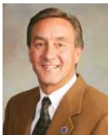
Rep. Rick Berg

W e've had Governors, Cabinet Officers, a number of State Legislators, Mayors and other elected officials on the Board of Directors of the Theodore Roosevelt Medora Foundation, but we've never had our own member of the U. S. Congress.