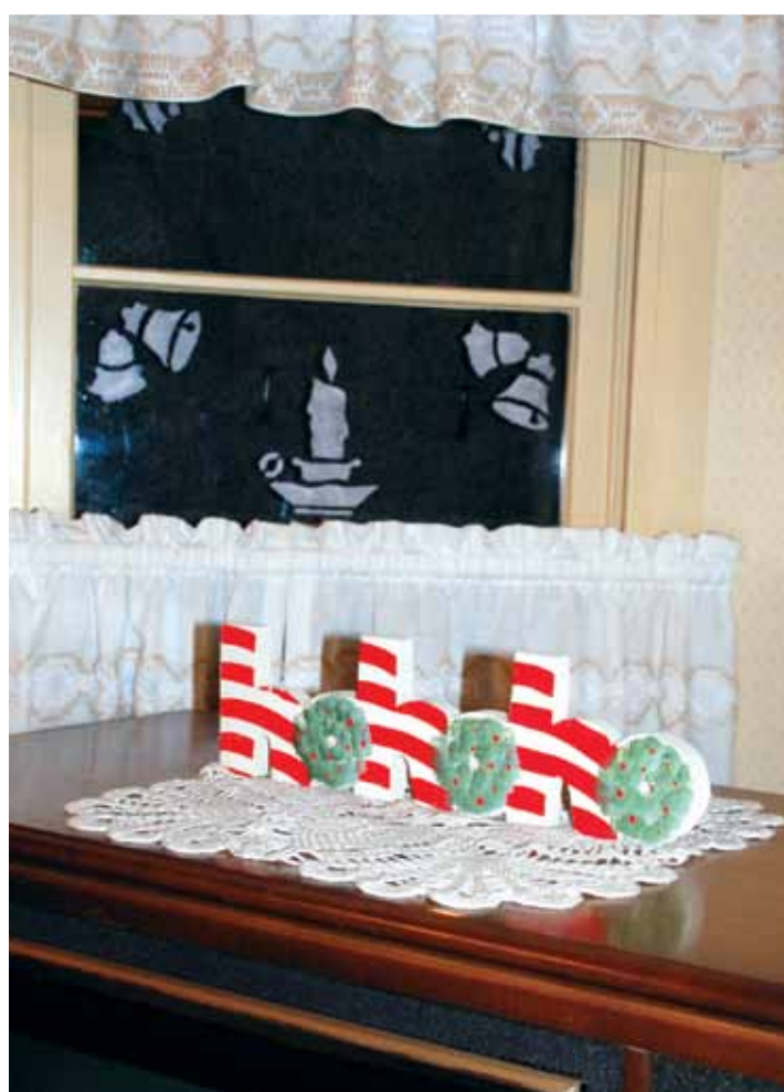
Glass Wax stencils decorated millions of windows in America in the 1950s and '60s.

His announcement created a stir across the continent and came to be known as "The Good Neighbor" commercial.