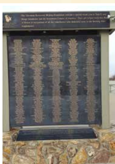
More than 2,000 names of original seat sponsors in the Burning Hills Amphitheatre are inscribed on this permanent marker at the top of the Amphitheatre.

Many of you readers have your names on one of those seats, and your names are also inscribed in bronze on our large recognition wall at the top of the Amphitheatre. That wall will remain there as a permanent reminder of who really built this magnificent showplace, because that first "Seat Campaign" raised