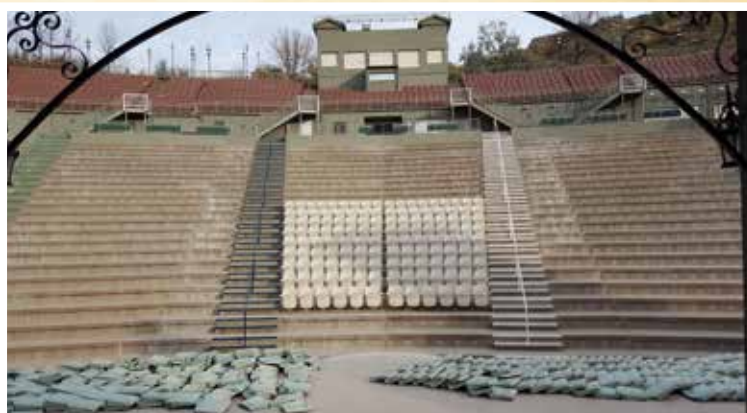
All new seats are in the process of being installed in the lower level of the Burning Hills Amphitheatre.