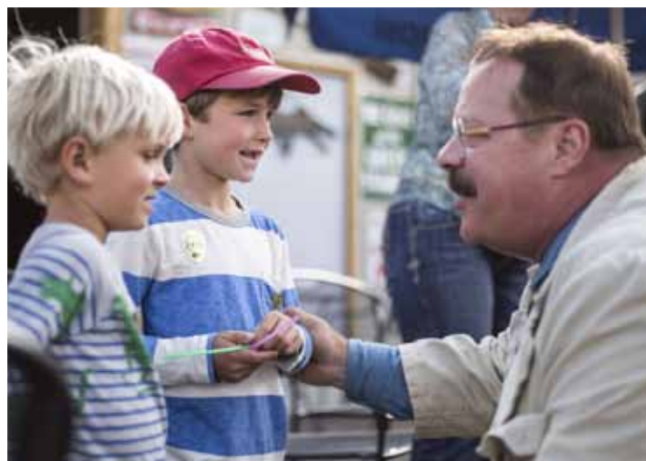
A couple of young visitors enjoy meeting the president.