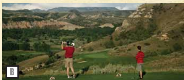
Bully Pulpit : Two Rounds of Golf