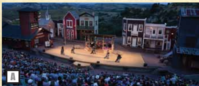
Medora Musical : Two non transferable season passes