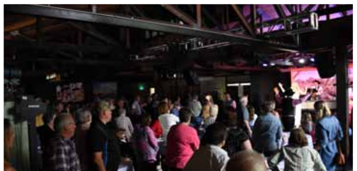
The Medora Gospel Brunch was a big hit in its first season, playing to standing room only crowds most of the summer.