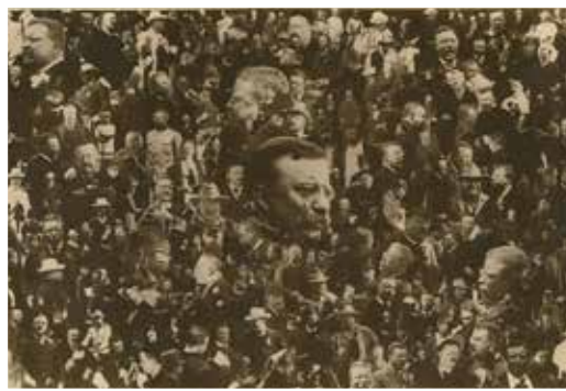
The Theodore Roosevelt Presidential Library and Museum in Medora will be home to many photos of TR taken throughout his life. Thanks to the Theodore Roosevelt Center at Dickinson State University for this composite photo.