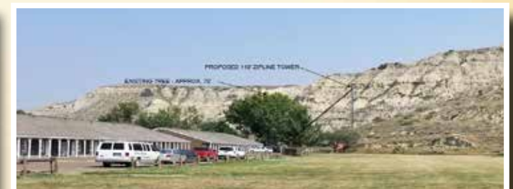
The Zipline will climb the butte behind the Badlands Motel.