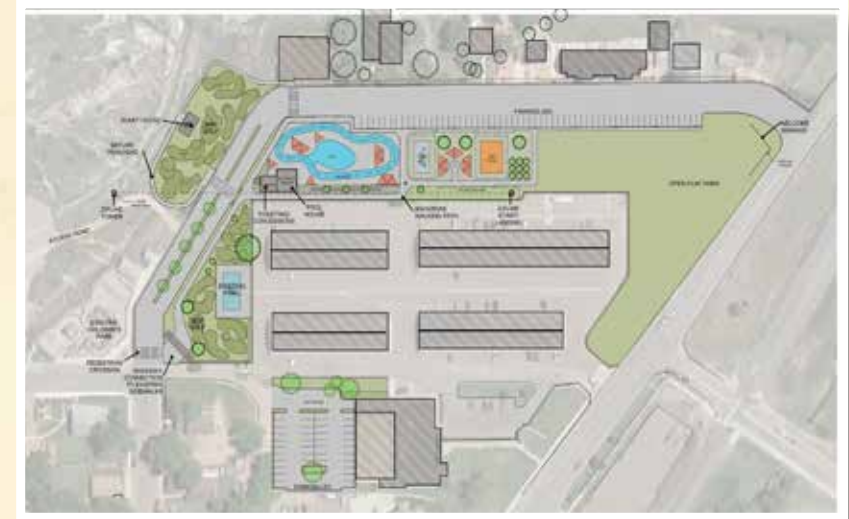
Here's our architect's initial design for the Point to Point Park.

It's the newest in a series of major investments in Medora to enhance and expand the experience our visitors and guests have. The idea and concept is driven in large part by the long-held awareness of the need to create attractions and attractors for what we have come to call the "missing middle," young people in their teens and their families. The new park is just the attraction young families