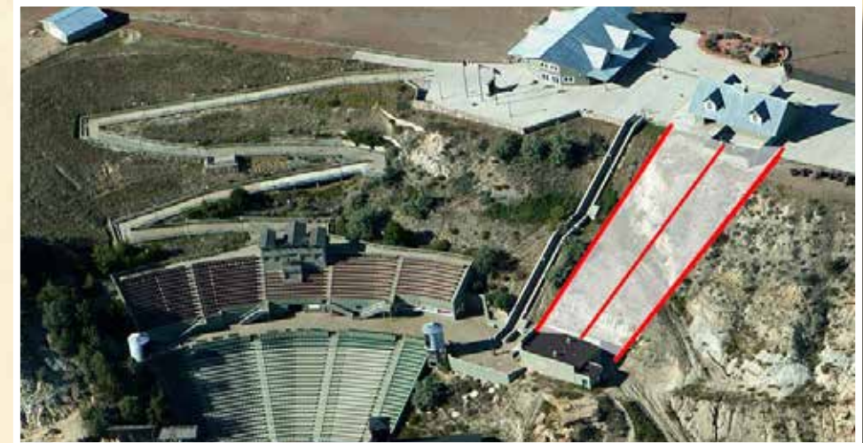
The new Incline Elevator for mobility impaired guests will be located right beside the existing escalator.

Thank you for considering sponsorship of this valuable addition to the Medora Musical !