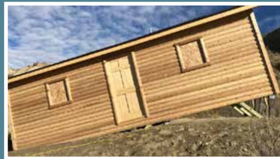
Up is down, and down is, well, take a look for yourself at Medora's newest attraction.

This wacky new Medora attraction is open daily from 10 a.m. to 7 p.m. Stop by for a visit!