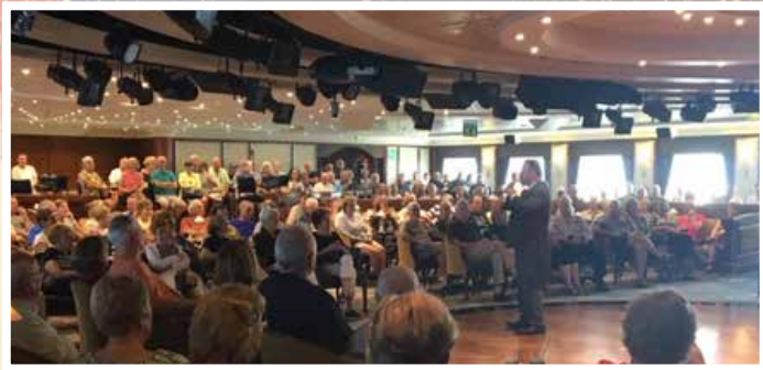
TRMF's own Teddy Roosevelt entertained guests aboard the Cuba cruise ship.

I'm sure more Americans will continue to travel to Cuba. Cuban communism is slowly, very slowly, loosening its hold on the people and the economy. Human pursuit and progress strive towards freedom and respect for individual human rights, and I am certain that brighter days are ahead for the Cuban people.