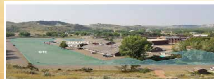
The area shaded in blue, surrounding the Badlands Motel, will be home to the Point to Point Park. Step out your motel room door and you're in the park!