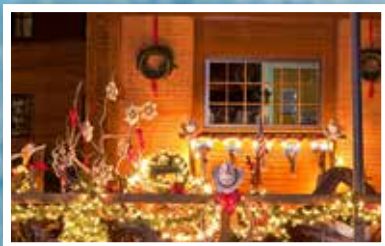
Medora will be all decorated up for Christmas again this year.