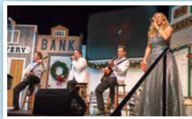
A Magical Medora Christmas Show returns to Medora November 30 and December 1

To reserve your weekend getaway, or buy tickets to the Christmas Show, just go to our website, medora.com , and click on "Tickets."