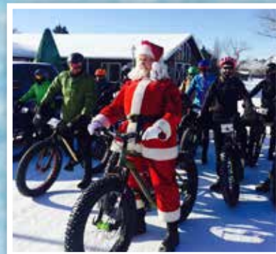
Santa leads the way in Bold St. Nick's Fat Bike Race

Find all the details, and register to ride at experienceland.org/bold-st-nicks-fatbike-race/