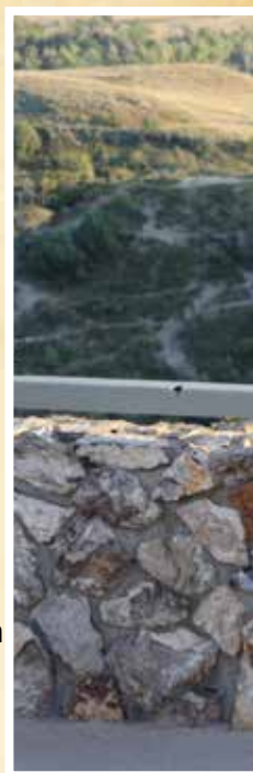
TRMF Board m

Clement. "Wouldn't it be wonderful if they could get in free every night, even weekends? Or get free ice cream? Or free pizza? And maybe even a free horseback ride on a Badlands trail?"